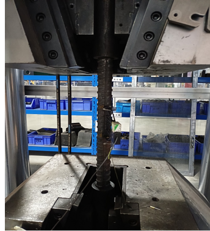
202360538-Tensile test-In test