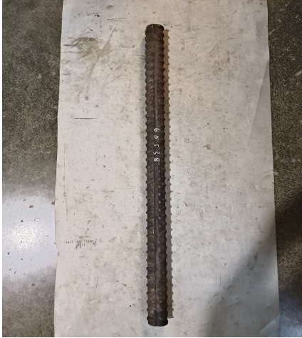
202360538-Tensile test-Before test