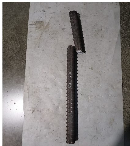
202360538-Tensile test-After test